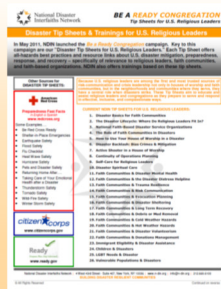
26 Tip Sheets For U.S. Religious Leaders