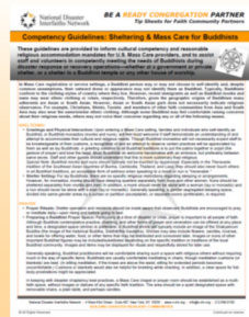
5 Mass Care Tip Sheets